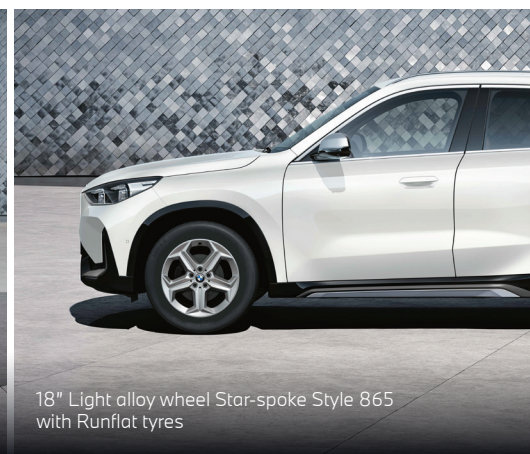
18" Light alloy wheel Star-spoke Style 865 with Runflat tyres