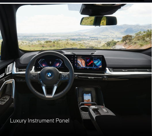
Luxury Instrument Panel