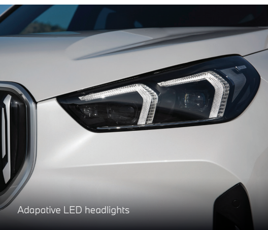
Adaptive LED headlights

Car specifications may vary from the model shown. Options and features available are model-dependent.