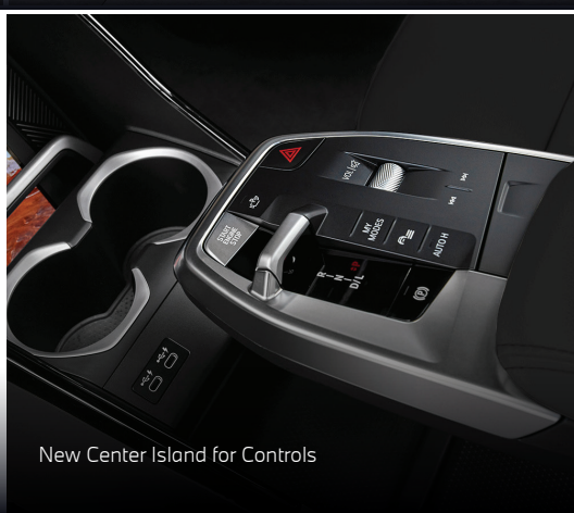
New Center Island for Controls